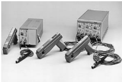
AM503 Current Measurement Family.