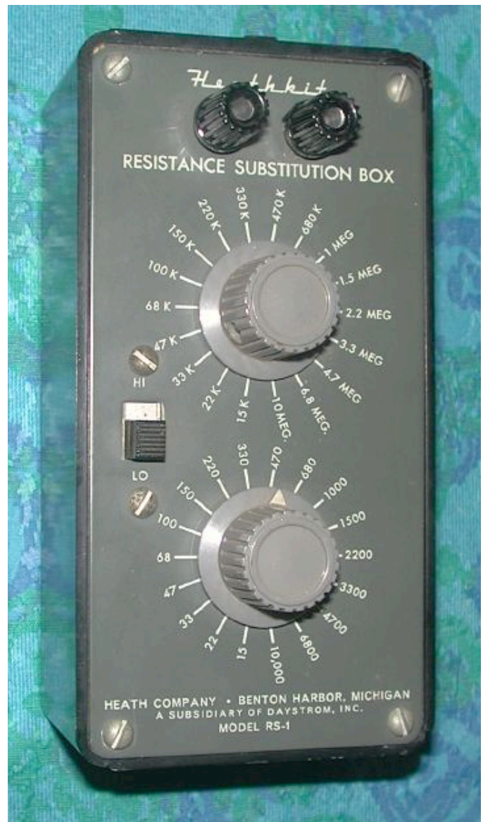
Figure 1: Heathkit RS-1 Resistance Substitution Box shown set for 470 ohms

A Resistor Substitution Box is just a simple piece of test equipment with two terminals that allows the user to select one of numerous values of resistors. These resistors are usually 5% or 10% tolerance. Since resistors tend to in-