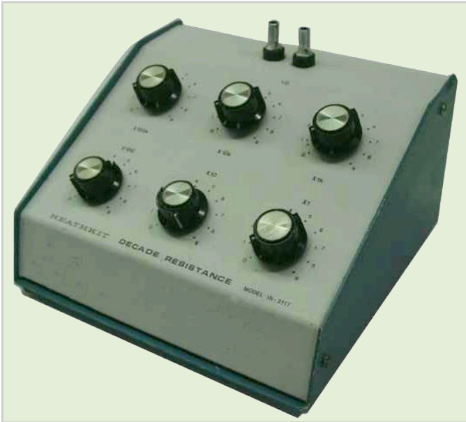
Figure 3: Heathkit IN-3117 Resistance Decade Box

tion selects two values. A slide switch on the lower part of the panel determines which of the two values is used. I was not able to determine if the 36 values of resistance available in these boxes are the same as the RS-1? However, that is the likely case.