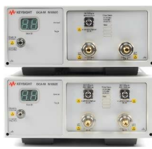
Optical + Electrical DCA-M