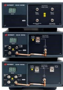
Electrical Clock Recovery Optical Optical + Electrical Clock recovery