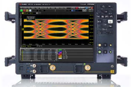
Available in 2 and 4-channel models