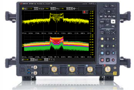
Keysight Infiniium UXR