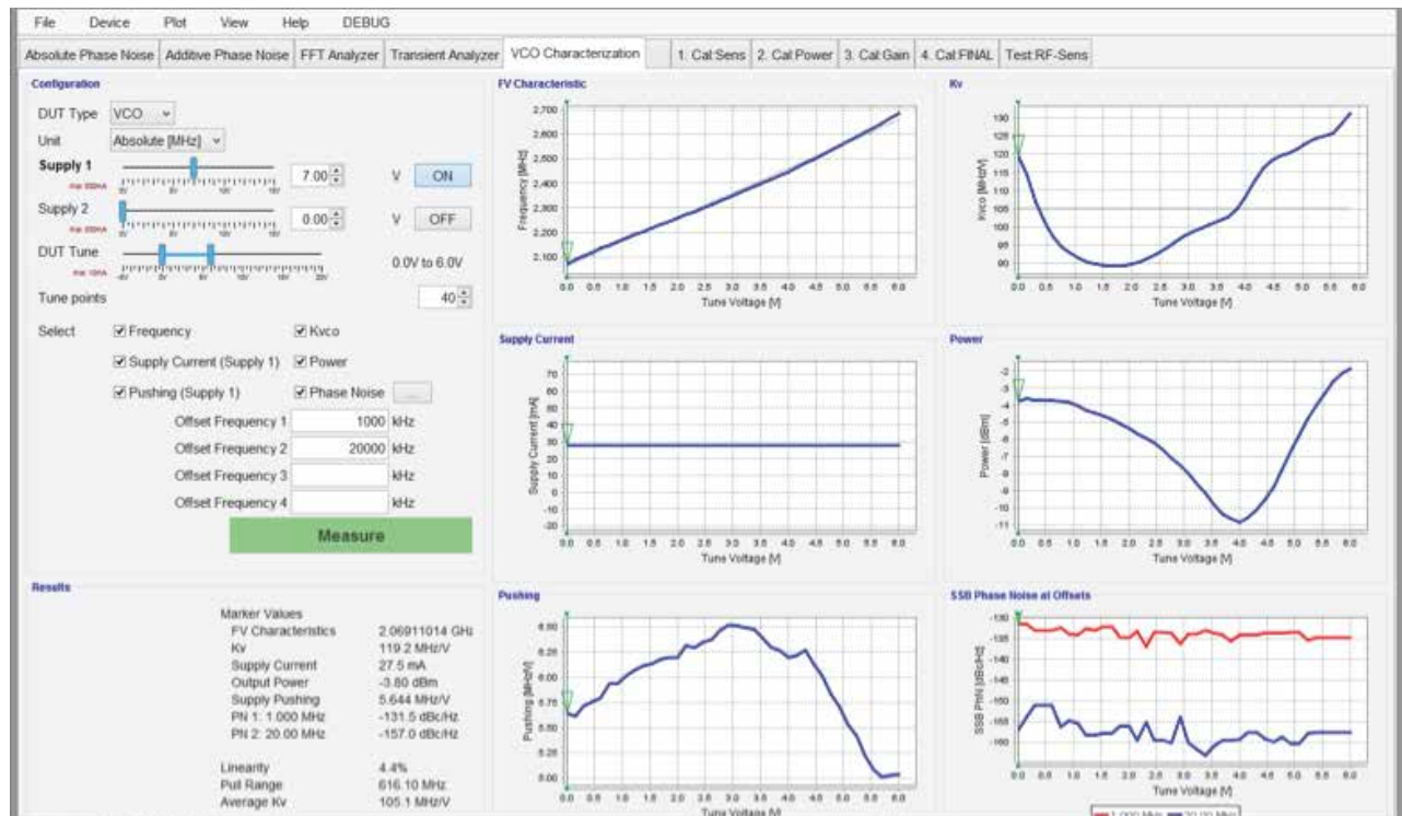
Figure 4. Screenshot of the GUI showing a completed VCO characterization of a wideband VCO.

The desired VCO parameters are captured in a single sweep. Measurement time per tuning voltage point for frequency, tuning slope, output power, supply current, and supply pushing is 100 milliseconds, and including phase noise at four different offsets in less than 800 ms. Figure 3 shows the full parameter capture of a wideband VCO ranging using the 7000 SERIES graphical user interface.