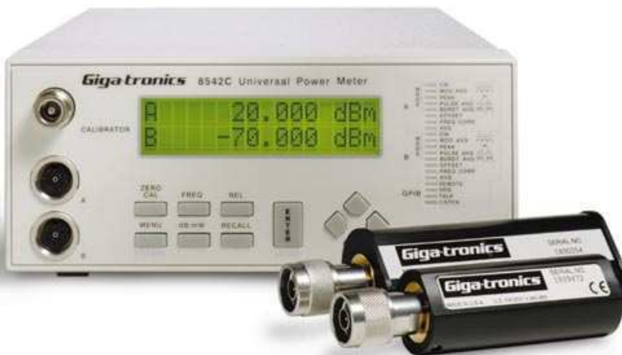
The Giga-tronics 8540C Series combines the speed, range, and capabilities needed to test today's sophisticated communications systems.

The exclusive Time Gating feature of the 8540C lets you program a measurement start time and duration to measure the average power during a specific time slot of a burst signal. This is critical for accurately measuring the average power of GSM, NADC and